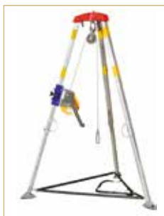
Tripod Access Systems